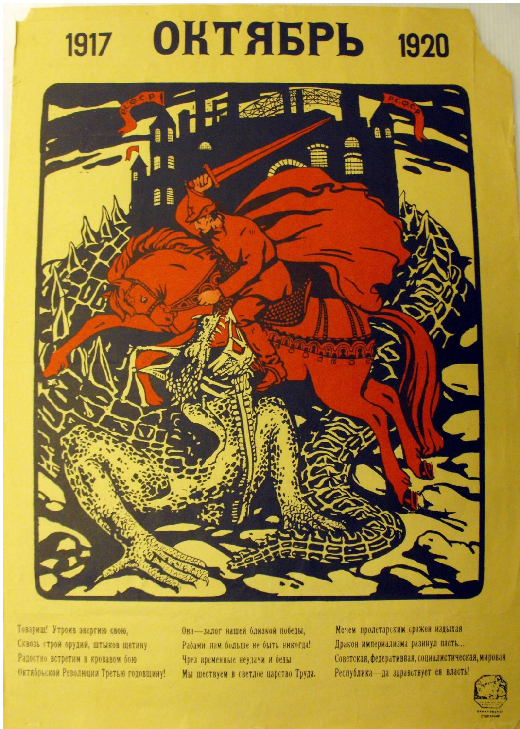
WMA 2008.2.1, gift of Anton Rajer