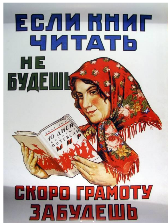
“If you don’t read books, you will soon forget how to read.” Book: 10 Days that Shook the World by John Reed, about the October Revolution Ed2008.1.8 (reproduction)

spread the revolutionary fervor and build a new society: Izvestia , the highest-selling Communist newspaper, had a high circulation of 400,000 copies, while Pravda reached barely a third of that number. 10 The Bolsheviks’ response to this dilemma was the propaganda poster. Political posters, following the example of the traditional Russian Orthodox icons, “could present symbols in a simple and easily identifiable way, even to barely literate peasants.” 11 In the early years of the Soviet Union, propaganda posters were used to spread literacy while at the same time indoctrinating the masses in Marxist-Leninist thought.