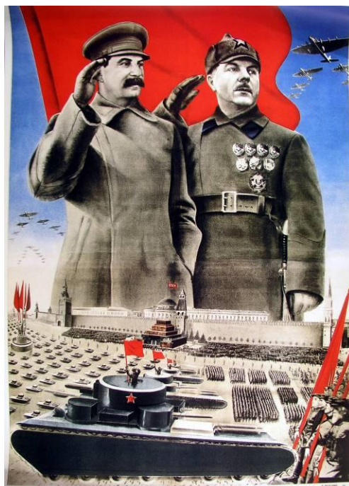
"Long live the worker-peasant's red army – the faithful guard of the Soviet borders!"